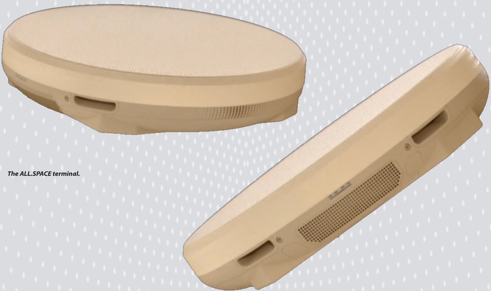
The ALL.SPACe terminal.

The ability to connect to multiple satellites without any loss of efficiency has been an enigma for the entire space industry. For decades, many companies and research labs tried to achieve this goal, but none were successful. ALL.SPACe took a completely different approach to the legacy technology that was inspired by a Roman drinking glass, the Lycurgus Cup . This cup bends light to illuminate with different colors depending on the angle that the light hits the glass. ALL.SPACe